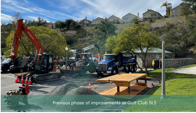
Previous phase of improvements at Golf Club SLS

The event featured presentations by OCFA and several residents who have implemented home hardening, followed by exhibits and demonstrations by several fire protection vendors. TCWD is a proud supporter of CAR and its mission to have all the master associations in the city of Rancho Santa Margarita work cooperatively to address community-wide issues like wildfire prevention and protection.