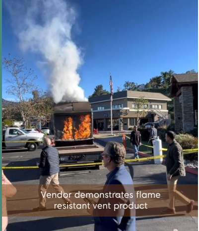
Vendor demonstrates flame resistant vent product