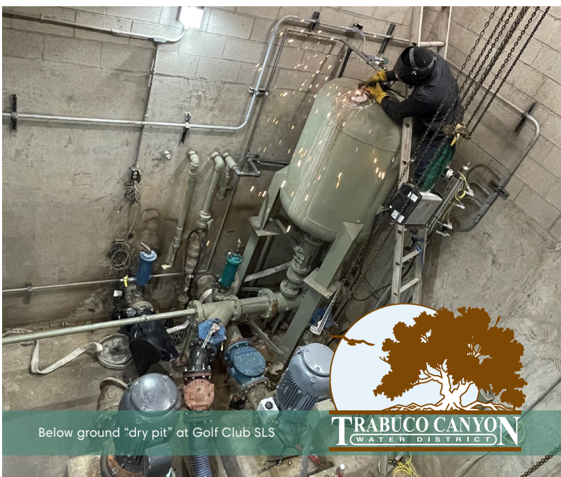
Below ground "dry pit" at Golf Club SLS