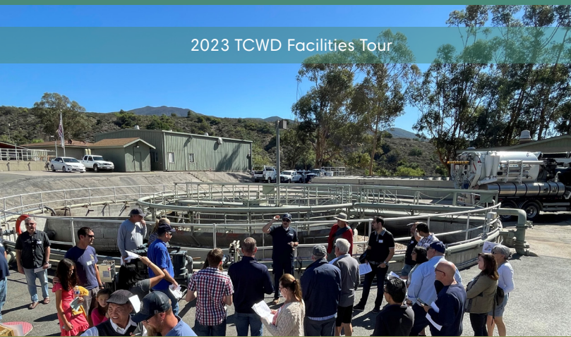
2023 TCWD Facilities Tour